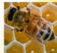
ČEBELARSTVO 70 PANJEV