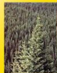
GOZD 52 ha