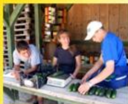
POSKUSI V VRTNARSTU IN POLJEDELSTVU