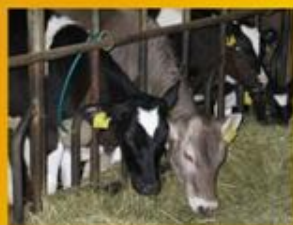
MLADA ŽIVINA 100 GLAV