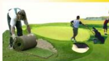
GOLF IN TRAVNI TEPIHI