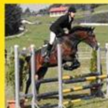
KONJI 30 - 35