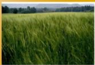
NJIVE – 72 ha TRAVINJE – 61 ha OSTALO – 8 ha