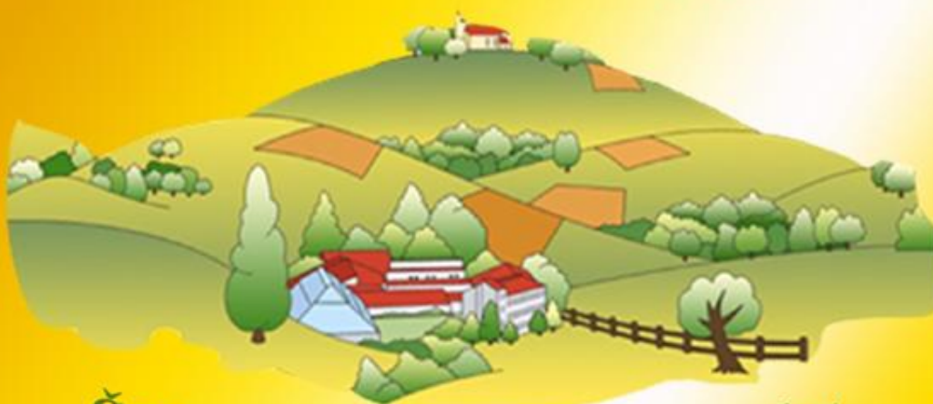
ŠOLSKO POSESTVO - 250 ha