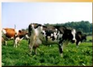
PRIREJA MLEKA 50 KRAV