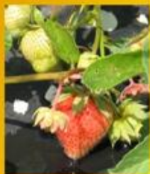
VRTNARSTVO – 5 ha PAPRIKA PARADIŽNIK ZELJE,...