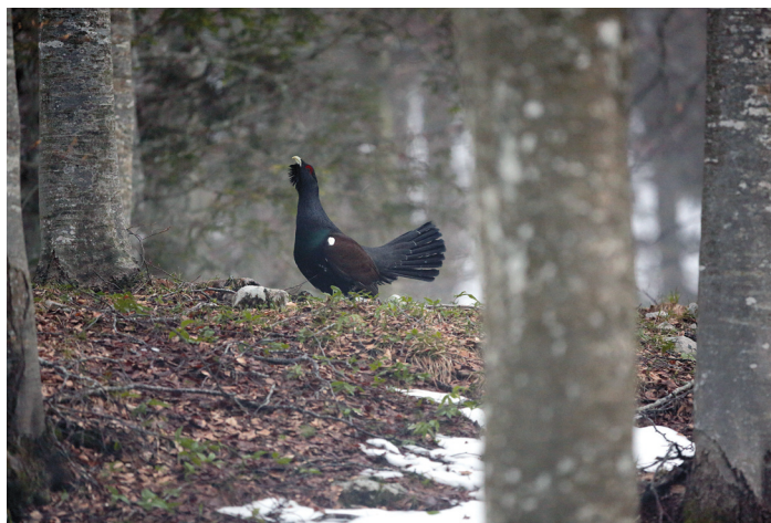
Western capercaillie in the Cansiglio beechwood

Best known for the sensational displays of the males during courtship, the western capercaillie lives in mature forests with large open areas and rich, yet not too thick, undergrowth, which provides food, shelter and a place to nest in.