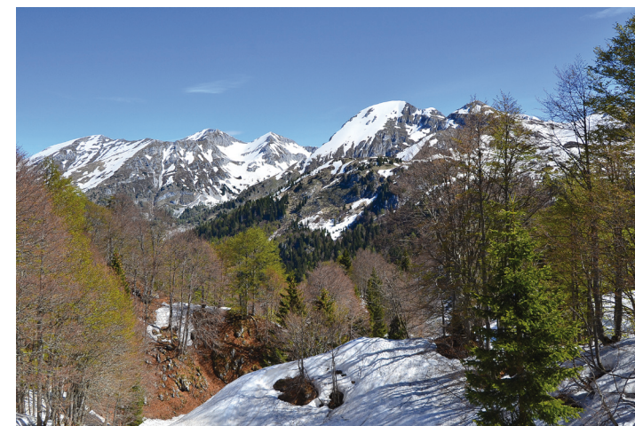
Ideal habitat of the Western Capercaillie

Its presence is an assurance of quality for the environment , which is why improving its habitat means contributing to the increase of an area's biodiversity .