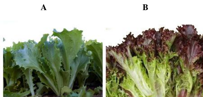
Figure 1: Open field cultivation of whole head lettuce (romaine lettuce) (A) baby lettuce leaf (lollo biondo) (B) and multi-leaf lettuces (read oak leaf) (C).